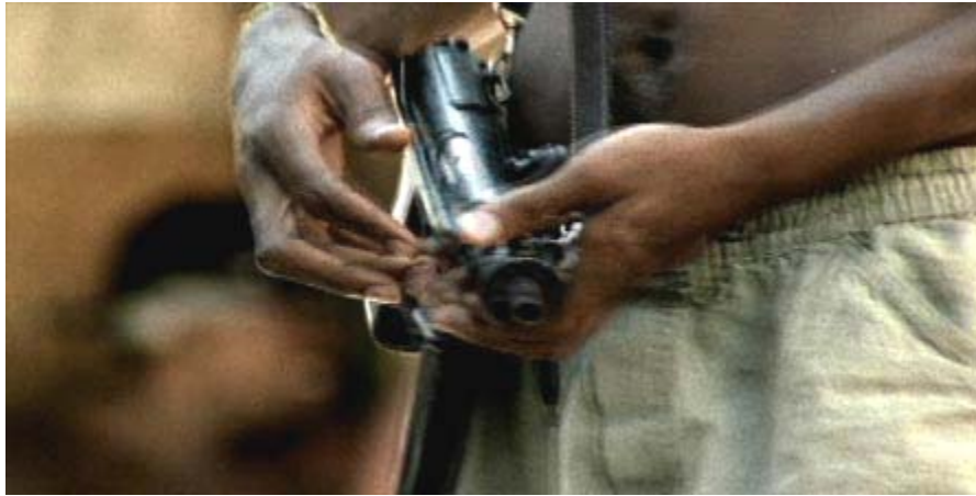
© Favela Rising , from www.favelarising.org