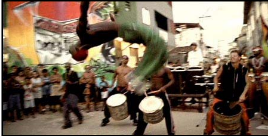
© Favela Rising , from www.favelarising.org

This resource packet includes the curriculum for a two-hour film screening and a 5-lesson unit for high school level students on understanding the power of community to address local problems.